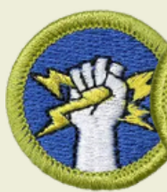
Electricity & Electronics