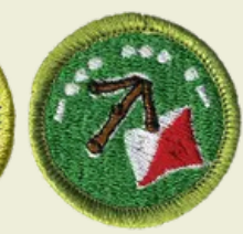
Signs, Signal, Codes