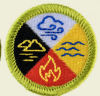
American Indian Culture